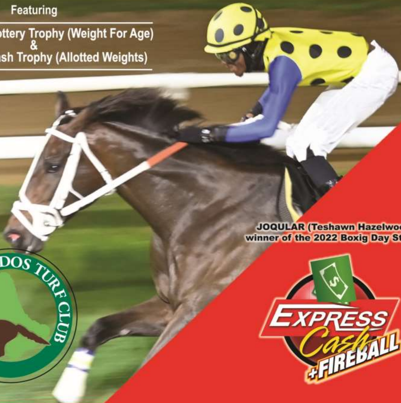
JOQULAR (Teshawn Hazelwood) winner of the 2022 Boxig Day Stakes

The Barbados Lottery Trophy (Weight For Age) & The Express Cash Trophy (Allotted Weights)