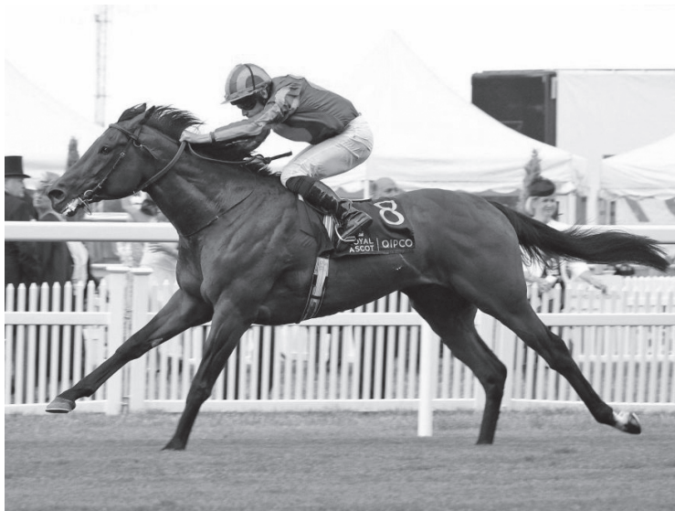
PADDINGTON (Bay 2020 16.1 hh (1.65 m) Siyouni - Modern Eagle (Monjeu)