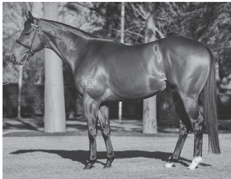
YES YES YES (Bay 2016 16.00 hh (1.62 m) Rubick - Sin Sin Sin (Fantastic Light)

Almanzor - winner of the Gr.1 Irish Champion Stakes, Gr.1 Prix du Jockey Club, Gr.1 Champion Stakes, Gr.2 Prix Guillaume d'Ornano etc. King Of Steel - winner of the Gr.1 Champion Stakes at Ascot & Gr.2 King Edward VII Stakes at Royal Ascot.