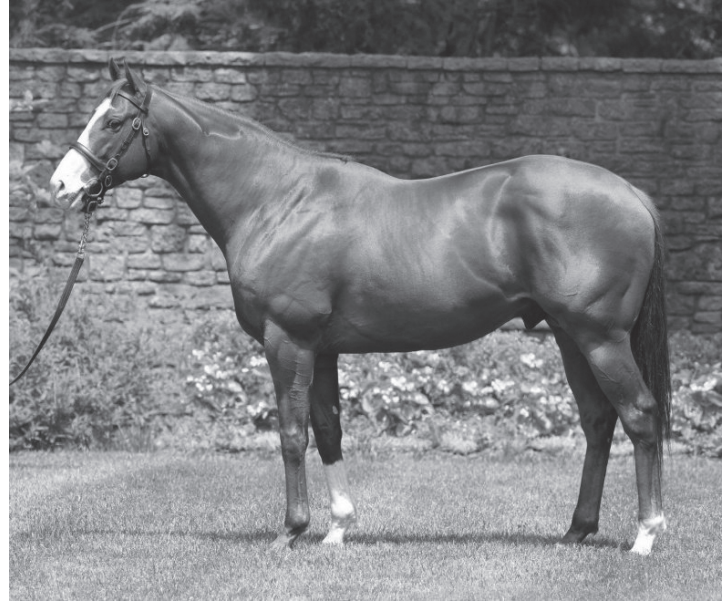
JACK CHRISTOPHER (Bay 2016 16.01/4hh (1.63m) Munnings - Rushin No Blushin (Half Hours)

Distance won over: 8f. to 12f. The fastest son of sire of sires Montjeu . An unbeaten G1-winning Champion 2YO with the speed to win a Guineas and the class and acceleration to win the Epsom Derby by 5 lengths, a run throughout which he stayed unbeaten.