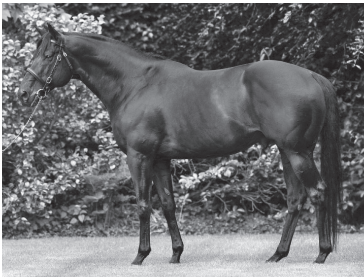
WOOTTON BASSETT (Bay 2008 16.0½ hh (1.63 m) Iffraaj - Balladonia (Primo Domine)

Won the Golden Jubilee Stakes-Gr.1 at Royal Ascot, July Cup -Gr.1 at Newmarket, Oakleigh Plate-Gr.1, Caulfield Guineas-Gr.1 etc. His top performers include... State Of Rest - winner of the Gr.1 Prince Of Wales's Stakes, Gr.1 Cox Plate, Gr.1 Prix Ganay & Gr.1 Saratoga Derby Invitational Stakes European Champion 2YO Filly Millisle - winner of the Gr.1 Cheveley Park Stakes