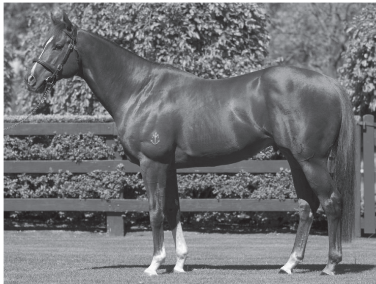
STAR SPANGLE BANNER (Chesnut 2006 16.0 hh (1.62 m) Choisir - Gold Anthem (Dayetnu)