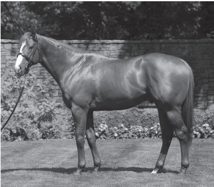
JUSTIFY (Chestnut 2015 16.31/2 hh) Scat Daddy – Stage Magic (Ghostzapper)

"Jack Christopher (Munnings) put on an absolute show with a jaw-dropping win against five overmatched rivals in Saturday's GI Woody Stephens S. at Belmont Park... the 1-5 favorite cruised up to take over leaving the quarter pole. It was only a question of how much he'd win by from there.