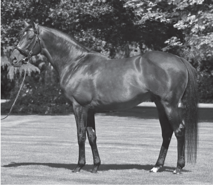
CAMELOT (Bay 2009 16.0 hh (1.62m) Montjeu – Tarfah (Kingmambo)

Distance won over: 8f. to 12f. The fastest son of sire of sires Montjeu . An unbeaten G1-winning Champion 2YO with the speed to win a Guineas and the class and acceleration to win the Epsom Derby by 5 lengths, a run throughout which he stayed unbeaten.