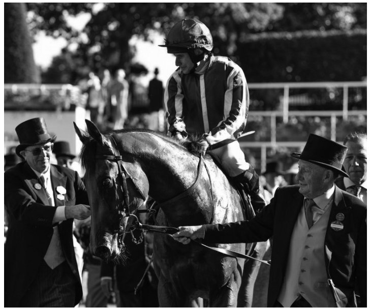
LITTLE BIG BEAR (Bay 2020 16.1 hh (1.65 m) No Nay Never - Adventure Seeker ( Bering)

The only unbeaten Triple Crown winner, ever! The best son of the sensational stallion and sire of sires SCAT DADDY 6 wins by nearly 24 lengths and nearly $3.8m from 7-12f., from fast to sloppy tracks. 5 triple digit Beyer Speed Figures in 2018. "It would entail a lengthy search to find a better representative of the Thoroughbred breed... Justify exudes power... In action, he brings the entire package: speed, stride, and stamina." - The Blood-Horse