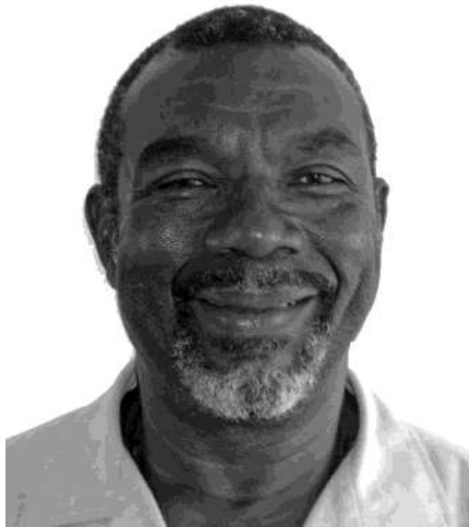
Sir Charles Christopher Griffith, KA, SCM

The Barbados Turf Club would like to congratulate former West Indies cricketer and longtime Horse Owner Sir Charles ("Charlie") Griffith who has been honored with a statue at Kensington Oval in Barbados.